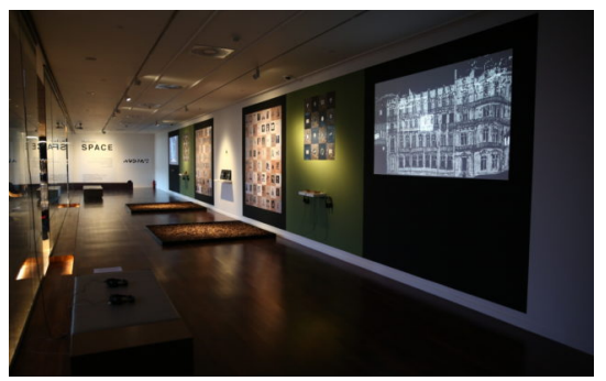
↑ AUDINT installations at the Berlin Academy of Art in 2009 (top), Brooklyn's Art in General in 2011 (lower left), and Sónar Istanbul this past spring.

So there is AUDINT via sound and/or moving image, but how do their works play out spatially? In one exchange the collective described their recent works as "an investigation of deceptive frequency-based strategies, technologies, and programs developed by military organizations to orchestrate the phenomena of tactical haunting within areas of conflict." The operative phrase there is tactical haunting — that's exactly what their installations achieve. The recent AUDinst019: Upload=Delphic Panaceas deployed smell (cedar chips), taste (miracle fruit — which reverses the polarity of the taste buds), and touch (SubPac bass rumble vests) to augment various fragments from their AV archives. Presented at Sónar Istanbul this past spring, the installation harnesses unconventional means and mediums — "transmodal affective environments," in the collective's nomenclature. The earlier Dead Record Office (above lower left image) deployed some of the same material in situ within kind of a 'record store graveyard' for their sprawling dead media collection.